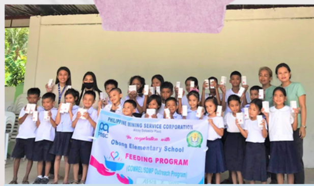
Feeding Activity at Obong Elementary School & Pasol-Pugalo Integrated School

The company allocate a budget in its SDMP to provide medicine and health equipment to the communities through the Barangay Health Centers, to conduct feeding activities, to provide materials for the construction of household toilets, for the improvement of water supply facilities in the host community, to assist the needs during blood letting activities, etc.