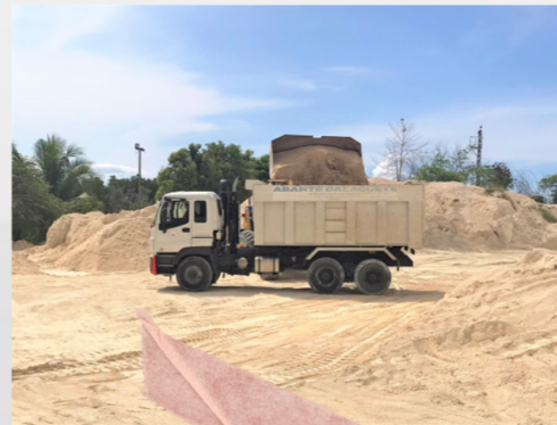
Dolomite Materials Assistance to LGU Alcoy & Dalaguete