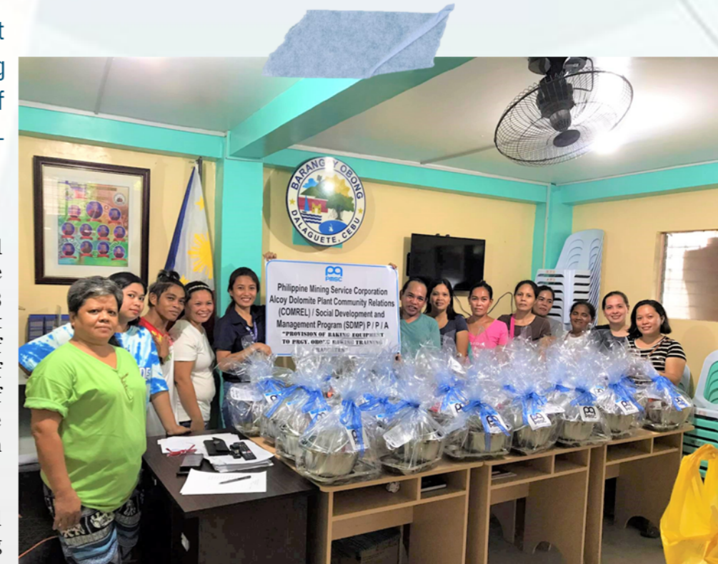
Provision of Baking Equipment to Baking Training Graduates -Obong, Dalaguete, Cebu-

Aside from these, since Livelihood Programs also includes skills training and development, acceptance of On-the-Job Trainees were also implemented and is part of this program.