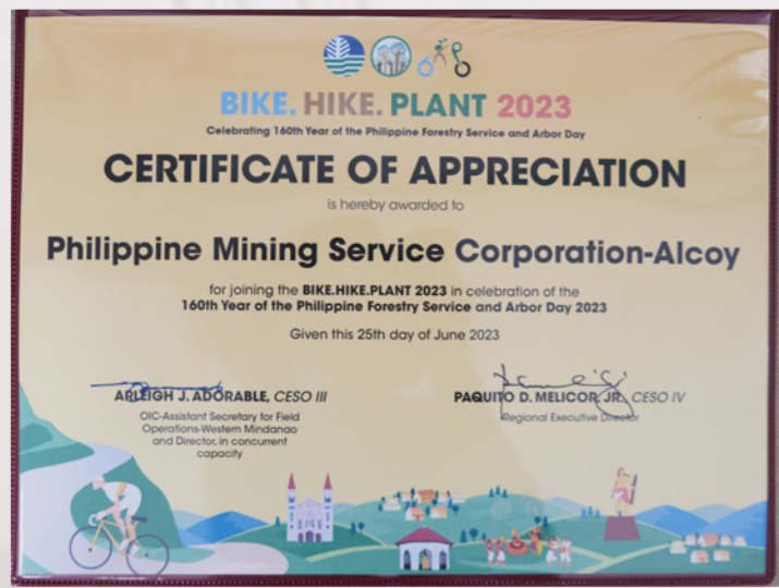
Certificate of Appreciation from Forest Management Bureau

Geared towards promotion of public awareness and education to the community.