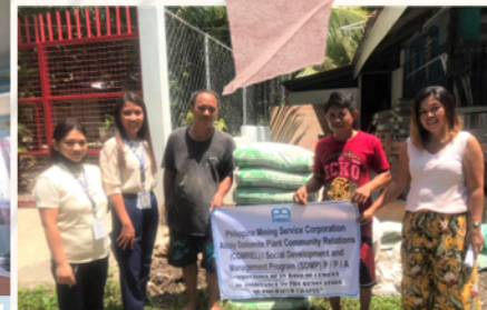
Provision of Cement to Poo-Balud Chapel