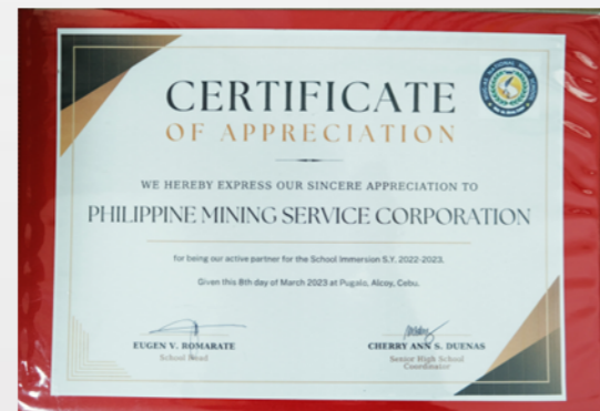
Certificate of Appreciation from Nug-as National High School