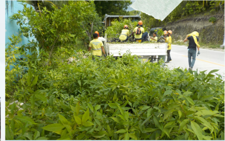
Delivery of Molave Seedlings for Tree Planting

One of the company's commitment is to establish a nursery for the propagation of different kinds of seedlings/wildings. Seedlings produced in the nursery are intended for afforestation and reforestation in our vacant areas near processing plant. Also included is the donation of seedlings not just for the tree planting activities of the company but to individuals and organizations as well.