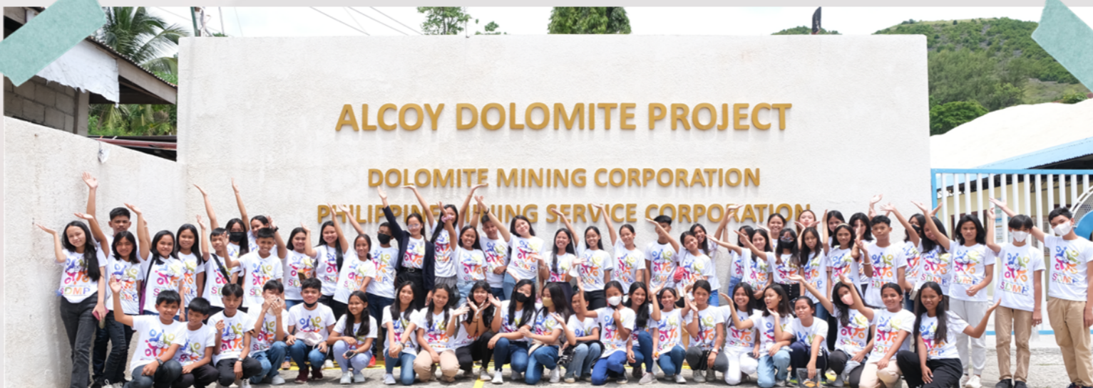
PMSC High School Scholars for SY: 2023-2024