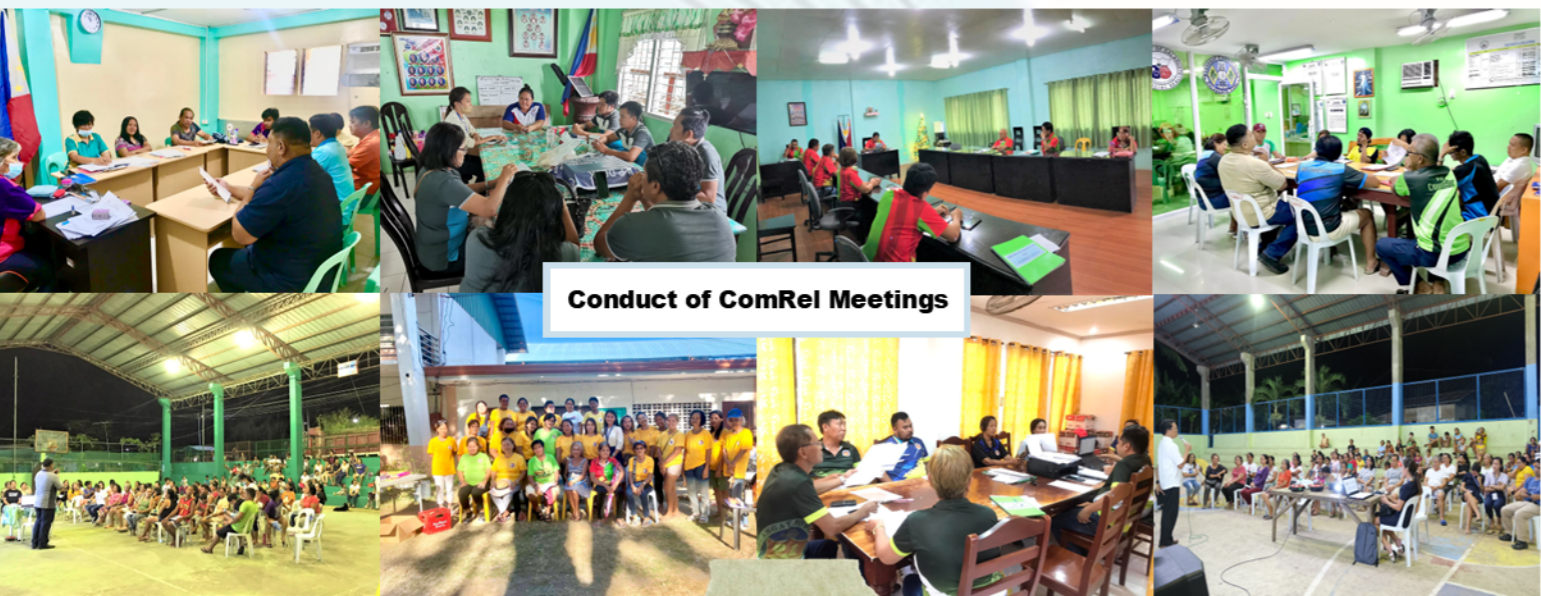
Conduct of ComRel Meetings