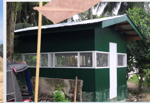
Construction of Uniformed Purok-Centers at Brgy. Pugalo