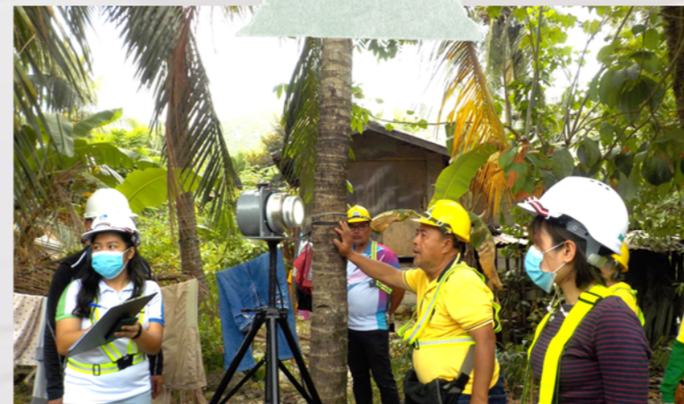
Conduct of MMT On-site Monitoring & Validation

Part of PMSC's goal is to develop our mangrove area through planting of mangrove seedlings and propagules best suited for protection from strong waves and provide breeding ground for fishes and other forms of macro and micro-organisms. Relative thereto, mangrove planting were also conducted on the months of January & March during the International day of Forests.