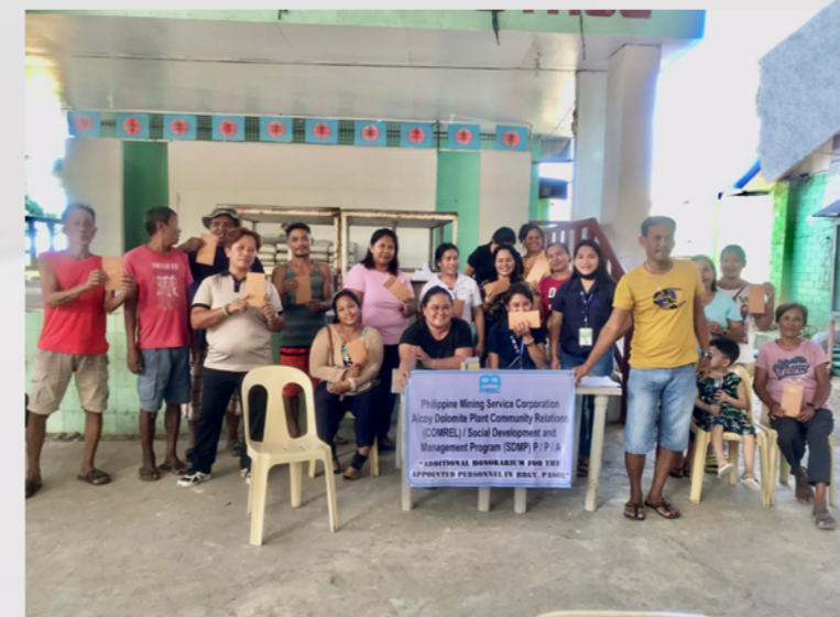
Provision of Additional Honorarium -Pasol, Alcoy, Cebu-