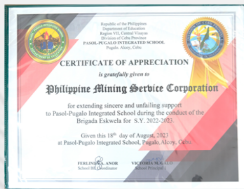
Certificate of Appreciation from Pasol-Pugalo Integrated School