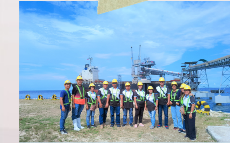
Conduct of Plant Tours

With PMSC, several IEC activities were carried out early this year. To mention a few, these IEC activities includes conduct of monthly meetings to the host and neighboring barangays, conduct of plant tours to various institutions, provision of IEC materials like magazines, bulletin boards and equipment, etc.