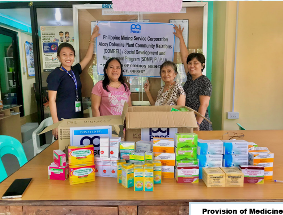
Provision of Medicine to the Host and Neighboring Communities