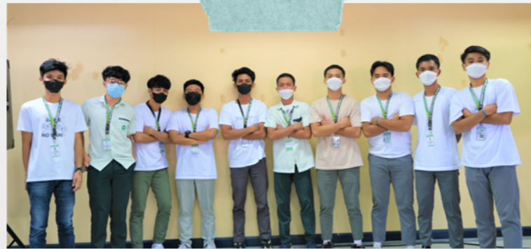
Acceptance of Senior High School Immersion

To date, 64 PMSC High School Scholars are enjoining this Program under SDMP. We support this exemption students through provision of allowance from Junior High School to Senior High School (Grade 7- Grade 12).