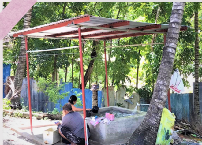
Improvement of Water Supply Facilities in Barangay Pugalo