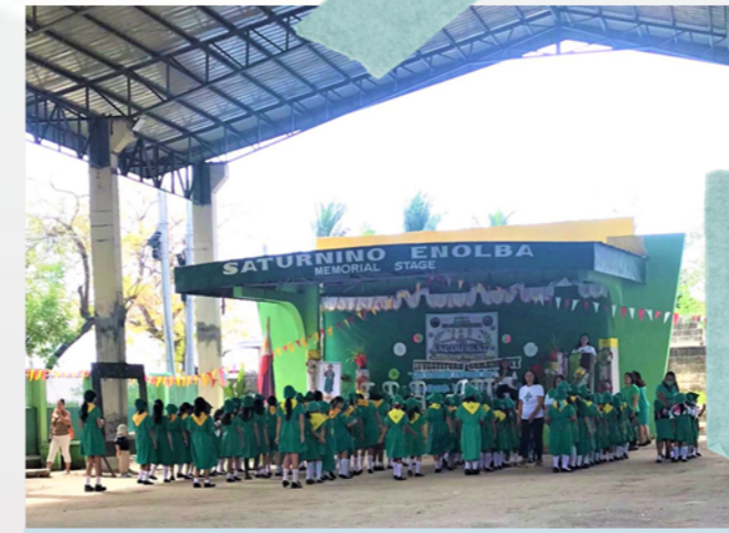
Assistance to PPIS Girl Scout Activity