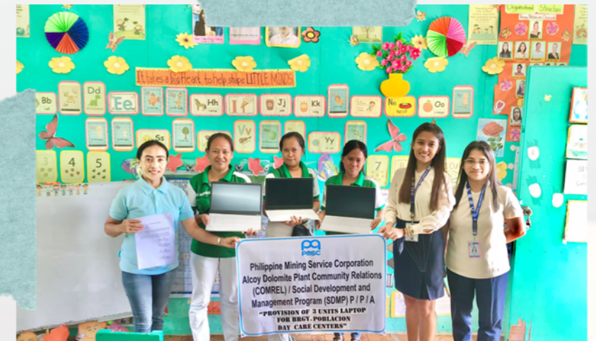
Provision of 3 units Laptop to Poblacion Day Care Centers