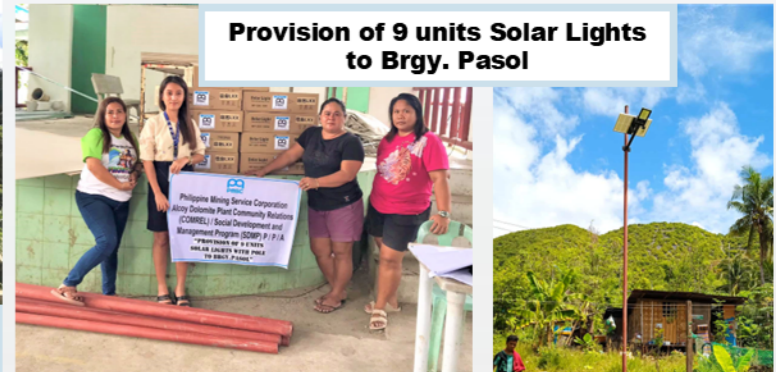
Provision of 9 units Solar Lights to Brgy. Pasol

Other P/P/A accomplished include dolomite material assistance to various construction activities in the Municipality of Alcoy and Dalaguete, provision of solar lights, construction of uniformed purok centers, provision of pathway and railings to PPIS, rehabilitation of Day Care and Health Center roofing and provision of cement/construction materials.