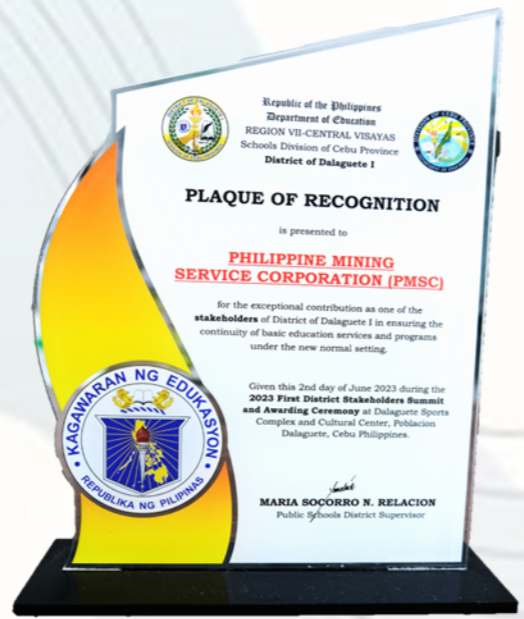
Plaque of Recognition from DepEd District of Dalaguete 1

Philippine Mining Service Corporation-Alcoy Dolomite Plant has established Programs/Projects/Activities (PPAs) that are geared towards the sustainable development of the host and neighboring communities in compliance also to DENR 2010-21, the Consolidated Implementing Rules and Regulations of Republic Act 7942, otherwise known as the Philippine Mining Act of 1995.