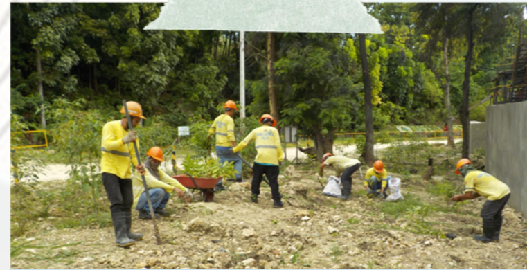
Tree Planting Activity within Plant Site