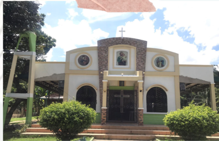
Construction of Pugalo Chapel Wings Extension

With SDMP, budget allocation for the construction, repair and assistance to various public infrastructure projects which gives long term benefits to the host and neighboring communities is also included.