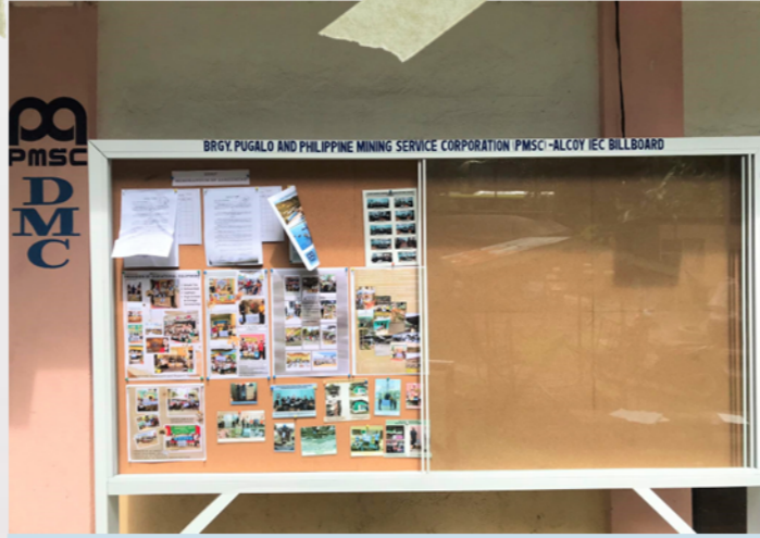
Provision of IEC Bulletin Boards to the Host and Neighboring Communities