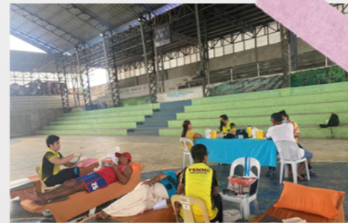
Assistance to Blood Letting Activities of Alcoy-MHO