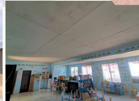
Repair of Brgy. Pasol Day Care & Health Center Roofing & Ceiling