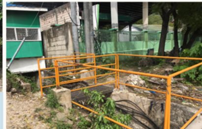
Provision of Pathway & Railings at PPIS