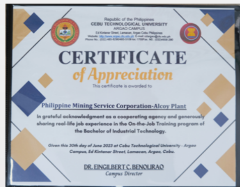
Certificate of Appreciation from Cebu Technological University-Argao