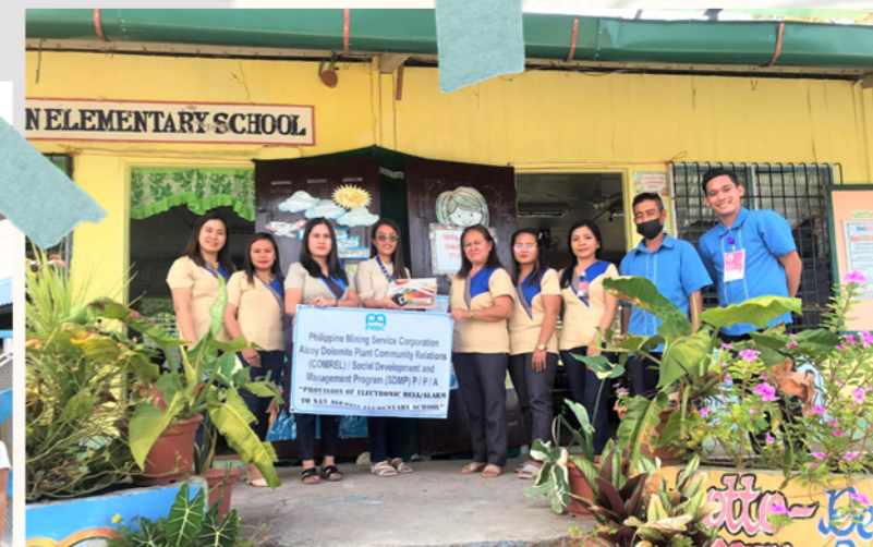
Provision of School Bell to San Agustin Elementary School