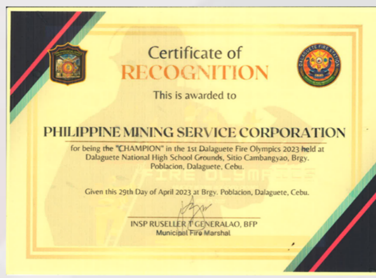
Certificate of Recognition from Bureau of Fire-Dalaguete