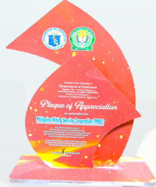
Plaque of Appreciation from Obong Elementary School